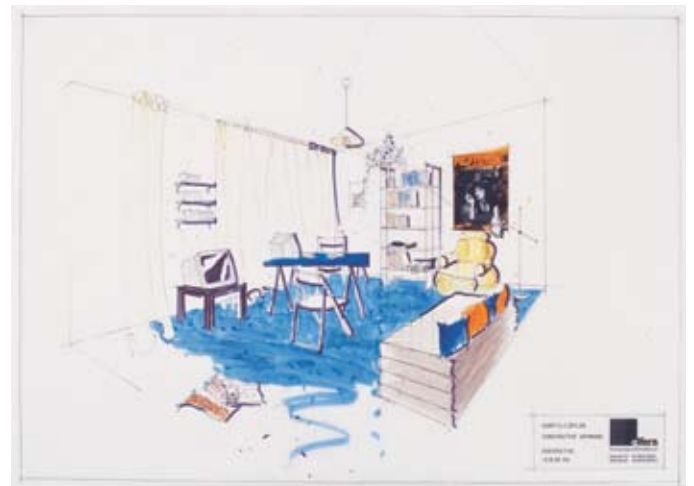
André Korpys and Markus Löffler Conspirative Housing Concept "Spindy," 1998 (detail)

Rather than representing specific members of the RAF or their terrorist acts, however, Korpys and Löffler chose to explore a specific apartment space once inhabited by the RAF. The two artists researched a known terrorist hideout in Hannover, taking photographs from the outside and drawing their own maps of the apartment from police photographs. The artists hired an interior design firm to translate the apartment into a contemporary space with stylish 1990s furniture and movie posters. Korpys and Löffler then built a model of this fictional apartment and demolished it—documenting the destruction with photographs of the debris. The accompanying artists' book is composed of reproductions of the police photos, the artists' drawings, an inventory of the furniture and objects in the original RAF apartment, and police reports and newspaper clippings relating to RAF activity—some of which may be fakes inserted by the artists.