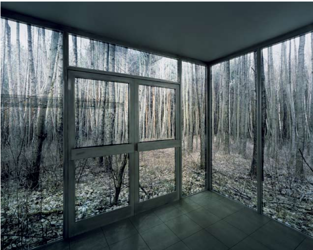
Sabine Hornig Large Cube in Forest , 2004