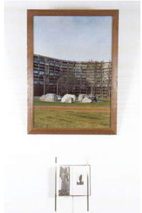
Sophie Calle Lenin Memorial , 1996 from The Detachment series