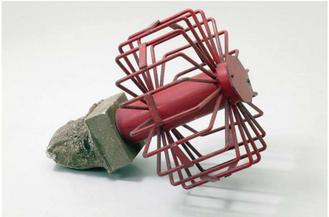
Manfred Pernice Untitled , 2002