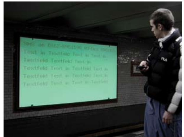
rude_architecture Urban Diary , 2001–2 (installation views)