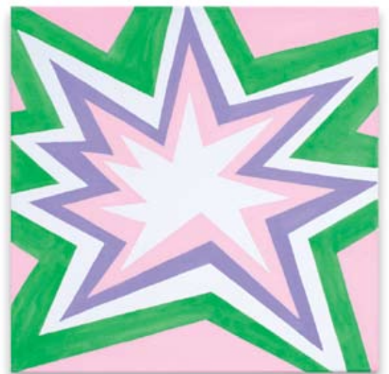
Michel Majerus Six paintings from Untitled , 1996–2002