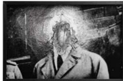
Rudolf Herz Two photographs from Museum Photographs, Dachau, 1976/80, 1996