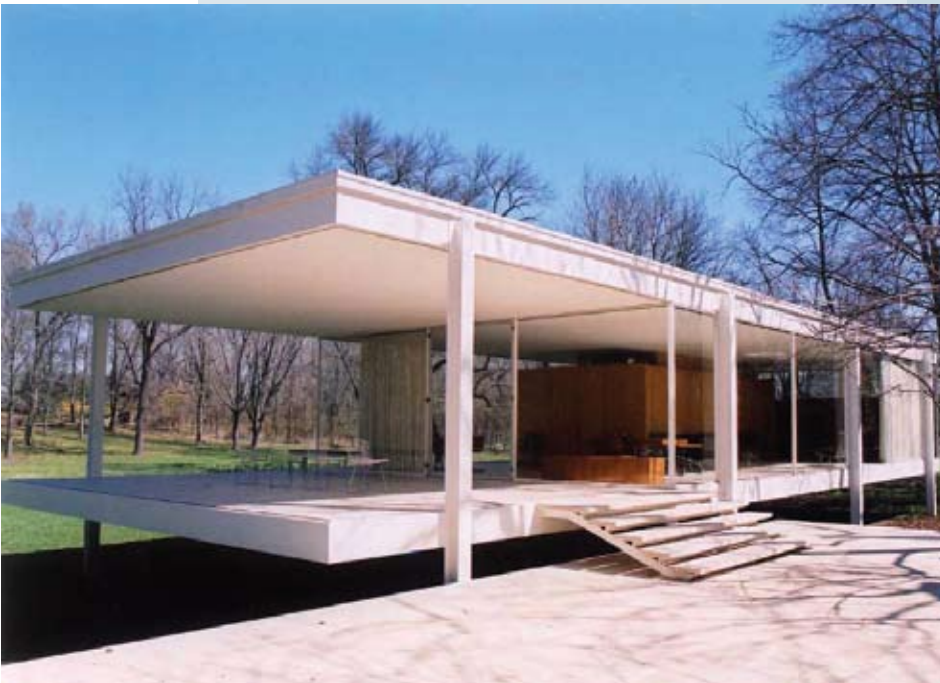
Ludwig Mies van der Rohe, Farnsworth House, 1951, Plano, Illinois