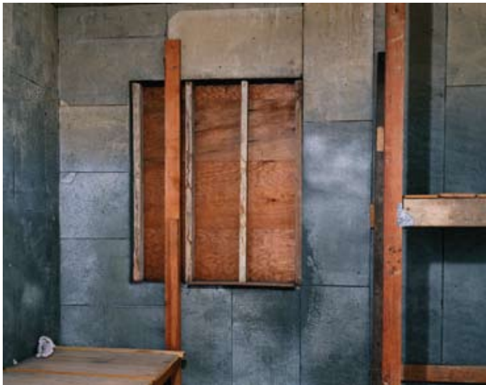
JEFF WALL Blind Window No. 2, 2000