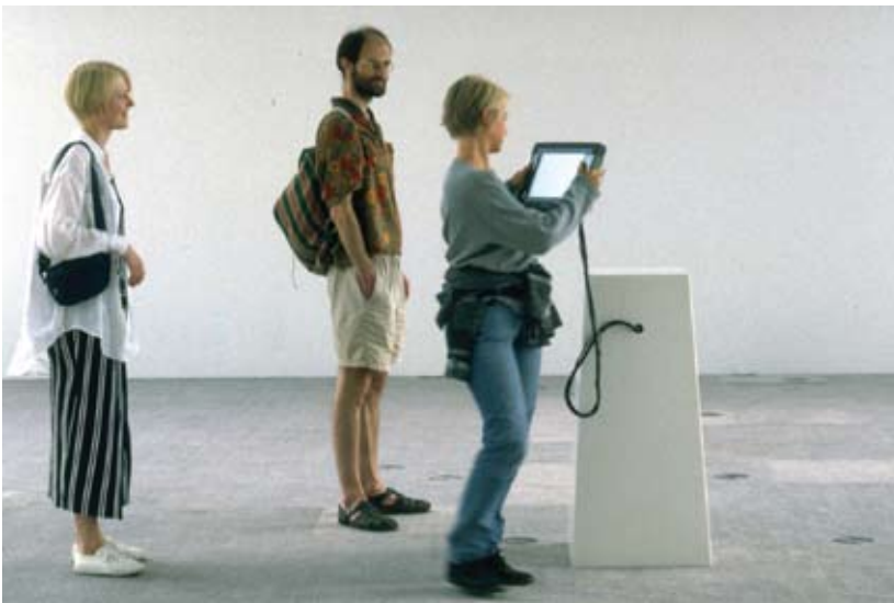
JEFFREY SHAW The Golden Calf , 1995 (installation views)

DIGITAL PICTURES RESIDE IMMATERIALLY INSIDE THE COMPUTER, AND THE COMPUTER SCREEN FUNCTIONS LIKE A WINDOW THROUGH WHICH THE VIEWER CHOOSES WHAT HE WANTS TO LOOK AT. FURTHERMORE, THE COMPUTER SCREEN FUNCTIONS LIKE A CINEMA CAMERA, BECAUSE THE VIEWER CAN PAN IN ANY DIRECTION OVER THE SURFACE OF AN IMAGE, AND ALSO ZOOM INTO THE DETAILS OF A CHOSEN IMAGE. THESE CHARACTERISTICS OFFER THE POSSIBILITY TO CREATE A VIRTUAL SPACE OF IMAGERY WHEREIN A THREE-DIMENSIONAL STRUCTURE OF RELATIONSHIPS BETWEEN TWO-DIMENSIONAL IMAGES CAN BE DEFINED. THIS CAN THEN CONSTITUTE AN INTERACTIVE SPACE WHICH THE VIEWER EXPLORES BY UTILIZING SOME KIND OF INTERFACE DEVICE.