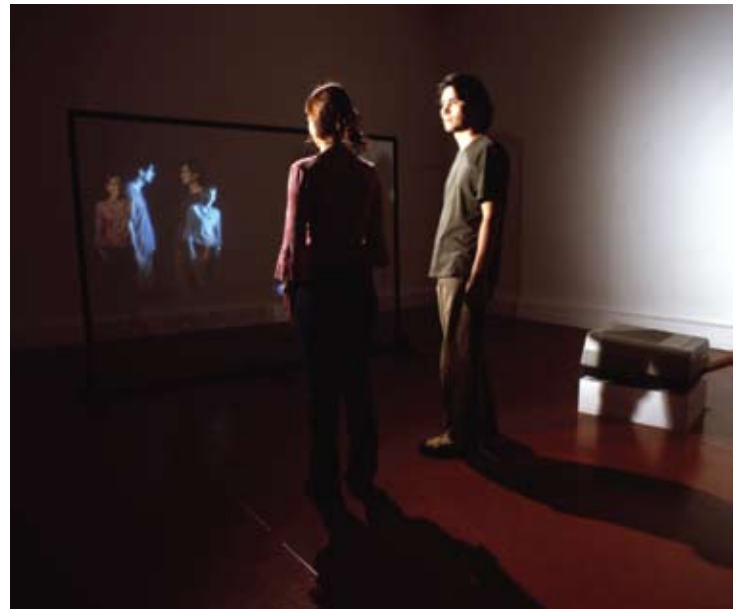
PETER CAMPUS Prototype for Interface , 1972 (installation view)