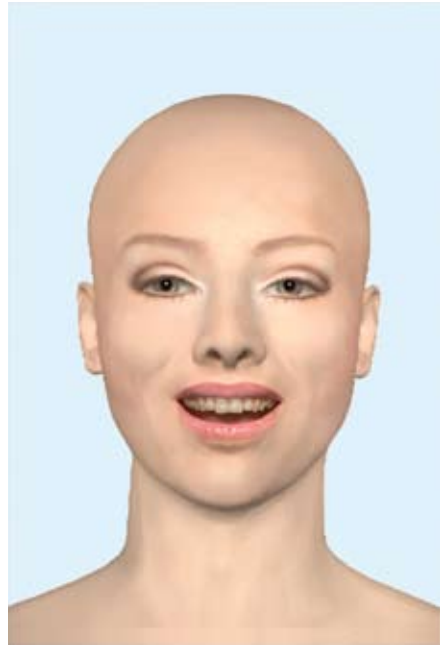
KIRSTEN GEISLER Dream of Beauty—Touch Me , 1999 (screen shots)