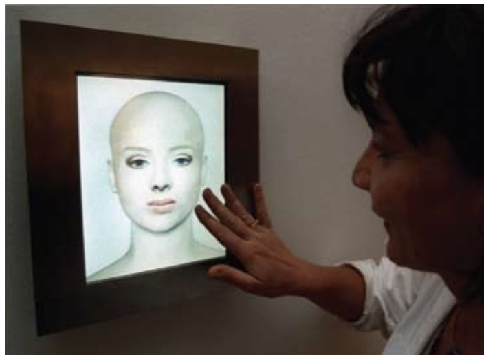
KIRSTEN GEISLER Dream of Beauty—Touch Me , 1999 (installation view)

Though we approach this interface with the hope for inter-human communication and physical contact, the woman's face can only react to our contact. Geisler exposes the extent to which even our contemporary screen culture, despite its frequently seductive appeal, remains a one-directional interface—still adhering to the logic of the Renaissance window.